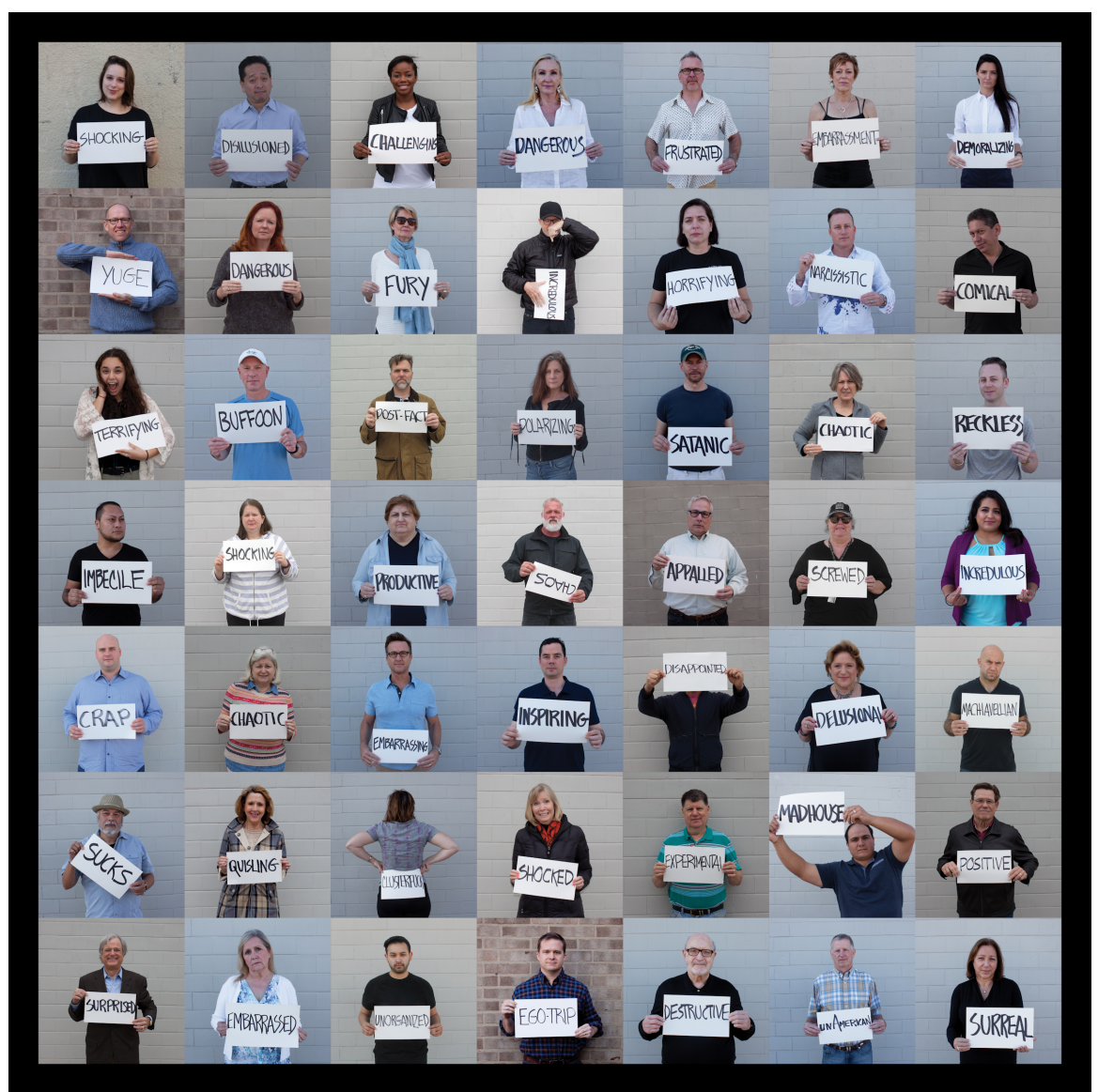
Lyn Sullivan, "Wall of Unity"